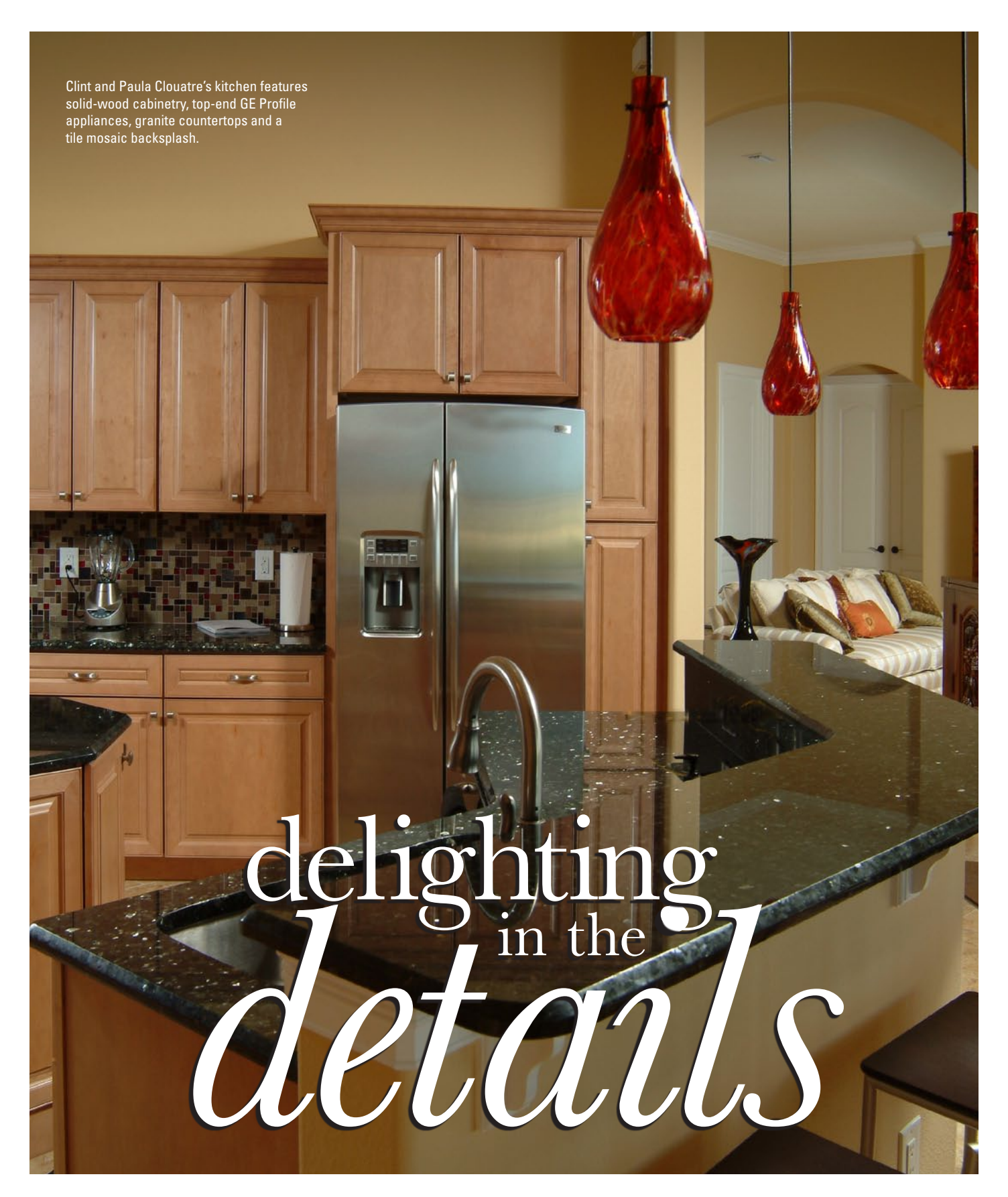
Signature features turn model to marvelous